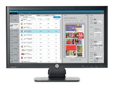
HP SmartStream software